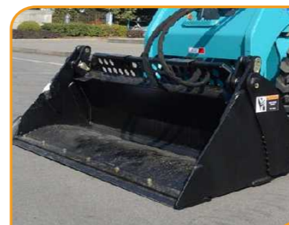
4 in 1 bucket